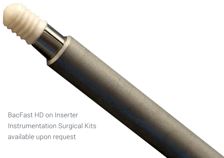
BacFast HD on Inserter Instrumentation Surgical Kits available upon request